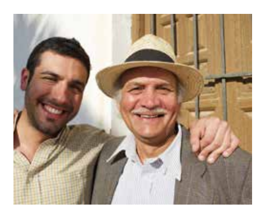
Coping with Change 13

by jealous brothers into a recovery from famine. God's care for parents of an empty nest can transform the painful absence of a son or daughter into new and more loving relationships.